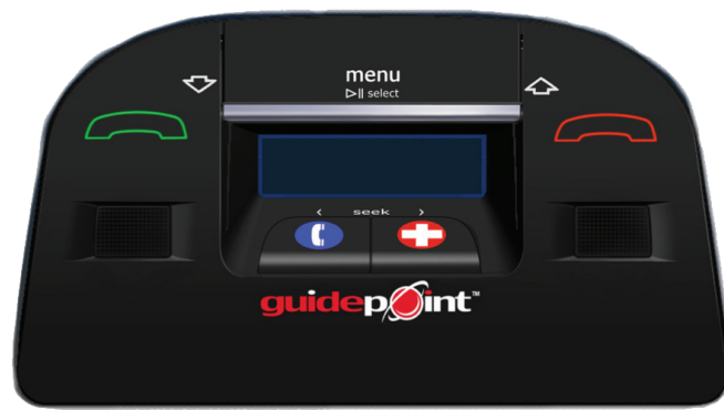
At just 1.5" high and 3" wide, the Guidepoint Connect packs loads of technology, including a Bluetooth receiver, MP3 player connection and Emergency Services.

And when you want the ultimate on-the-road assistance plan, upgrade to Guidepoint Connect Silver. With Silver you get FREE emergency roadside assistance, FREE directory assistance and FREE unlimited concierge service. So whether you need a tow truck, a phone number, travel reservations, sports scores or stock quotes, you can get it all FREE, 24/7/365!